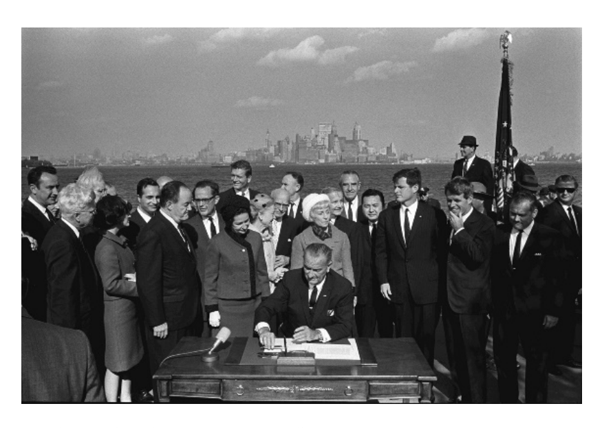
President Lyndon Johnson signing Hart-Celler Act, 1965.

The Hart-Celler Act of 1965 replaced the national origins system with a new quota system that gave preference to supporting family reunification and attracting skilled labor and professionals to the United States. It set the quota at an equal number for every country, regardless of that country's population or proximity to the United States. The act also expanded this quota system to countries in the Western Hemisphere, to which no limit had previously been applied. In this way, the Hart-Cellar Act represented a radical break from previous immigration policy and has had a major impact on the nation since that time.